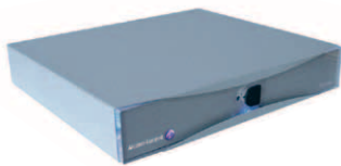
Extended Communication Server Compact Edition

The Alcatel-Lucent Extended Communication Server (ECS) offers an innovative approach to convergence for small- and medium-sized businesses (SMBs), and serves as a simple solution for information management and communications that is easy to deploy and administer. The ECS is a solution that transforms the way small and medium enterprises communicate by delivering fully integrated communication, collaboration and mobility solutions that are scalable, reliable and cost-effective.